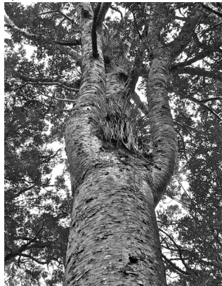
This is a Kauri tree, over a thousand years old. They grow high, majestically swaying as they pierce the sky.